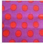
Fabric D 1/2 yard