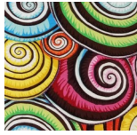
Fabric C 1/2 yard