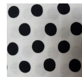
Piping fabric 1/4 yard

Piece of flannel for Pocket on Back Panel 21w x 10.5 high