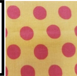
Fabric E 1/2 yard