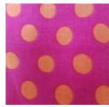
Fabric G 1/2 yard

Interfacing 1/3 yard of 45 wide Medium Weight fusible.